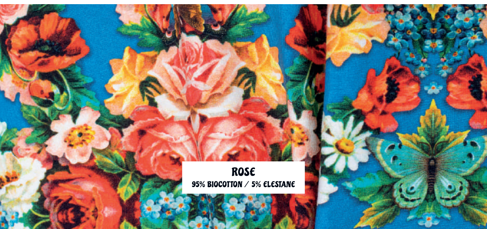
ROSE 95% BIOCOTTON / 5% ELESTANE