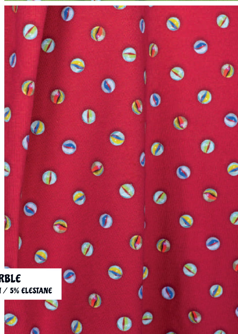
MARBLE 95% BIOCOTTON / 5% ELESTANE