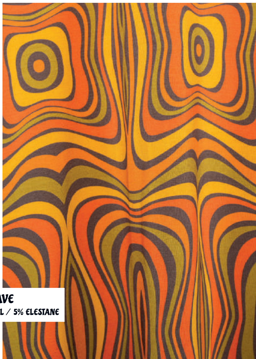
WAVE 95% MICROMODAL / 5% ELESTANE